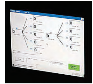
YardGlide® WL2000 in action