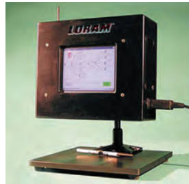
Wireless Communication Monitor